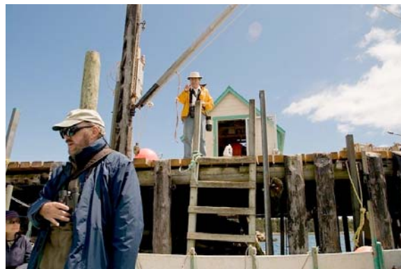
On the way to Sambro Island