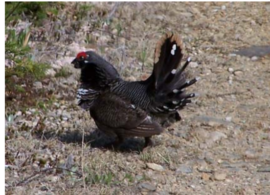
Spruce Grouse

estimate abundance once you've completed, or nearly completed, covering your square (after 20 hours). Another approach is to estimate abundance, as you cover different habitat types. For example, if you have already spent a considerable amount of time atlasing around rivers, wetlands and lakes, you probably have a good handle on the species and numbers breeding in those areas (e.g., ducks, geese, grebes etc...), so you should feel confident to make estimates for those species before you move on to other habitat types.