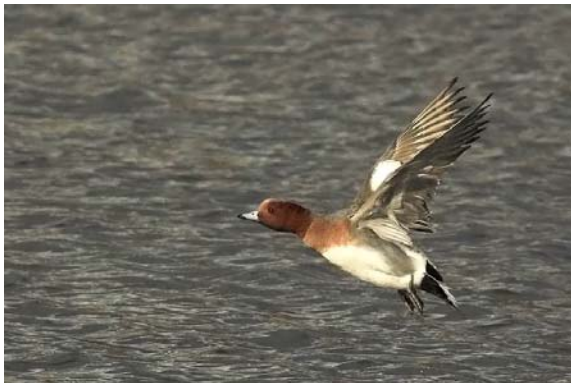
Male Eurasian Wigeon