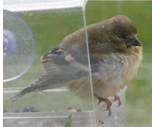
A lethargic American Goldfinch suffering from Trichomoniasis

sick American Goldfinch and Pine Siskin. Adults and fledged young of all three species have been observed exhibiting symptoms ranging from crusty, inflamed eyes to weak, lethargic birds with laboured breathing.