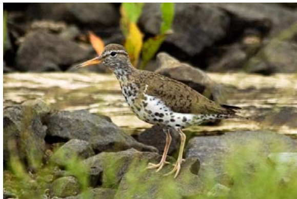
Spotted Sandpiper

Somewhat surprising is the decline in the probability of observing Killdeer between the first and second Atlas. Although many birders consider the Killdeer “common” (and it is listed as “common in the Canadian Shorebird Conservation Plan), the Maritimes Atlas isn’t the only study to indicate possible declines for this species. In Ontario, the probability of observation for Killdeer declined between atlases and BBS data also indicate significant declines in Killdeer populations across Canada (4% per year over the past 20 years) and in the Maritimes (9% per year over the past 20 years). The Spotted Sandpiper is another surprise on the list. BBS data indicate a significant annual decline of 14% per year for Spotted Sandpipers between 1987 and 2007 in NB, but population trends are not as clear cut in other provinces. If these trends, detected by the Atlas and BBS are real, there is cause for alarm because we don’t know what factors are influencing this decline.