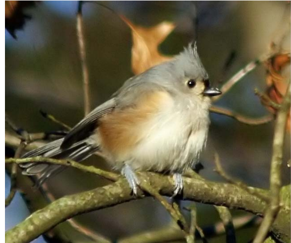
A Maritimes first: Tufted Titmouse confirmed in St. Andrews, NB

Hours of survey effort by square. Dark green squares have 20 or more survey hours.