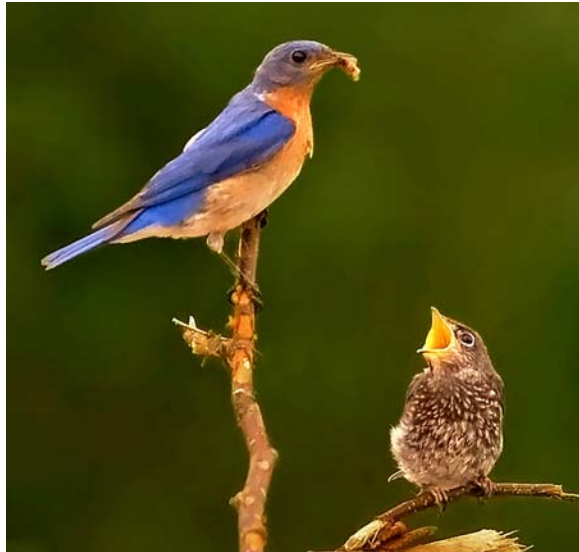
Bluebird carrying food to fledged young