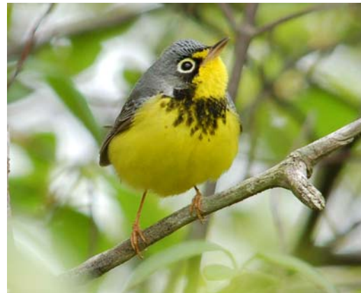
Canada Warbler

My advice (which I didn't always take, though I now wish I had) is to fill in the rare bird forms at the same time as you're filling in the breeding evidence forms. That way, you don't forget the details when, months later, the reminder emails from your RC finally hit home and you sit down with your notebook and a coffee (or two). It doesn't take long. The two most important pieces of information to supply are the location of the rare bird, and a description of its habitat. If you take your BE card into the field, the "notes" space on the front of the card is perfect for jotting down observation and habitat details and UTM coordinates.