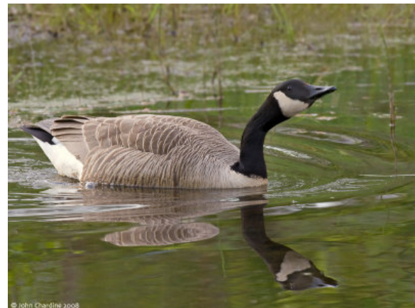
Canada Goose is one species being observed more frequently in all regions

As data are submitted and maps are updated, the question on everyone’s mind is “have there been changes between the 1 st and 2 nd Atlas?” At last, we are beginning to have some answers. One area where we can see changes between the two Atlases is in the probability of observing a particular species when atlasing a square. Changes in a species’ probability of observation can be indicative of distributional or population changes (e.g., if a species population has increased, you may be more likely to observe the species, whereas if the population has decreased you may be less likely to observe it).