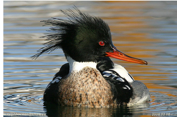
Red-breasted Merganser

While region 4 atlassers continue to be low in number, results are very encouraging! Point counts in all 18 priority squares are complete thanks in part to the assistance of Becky and her helpers. Point counts have also been completed in another 12 squares and started in 13 other squares for a total of 534 counts once all data are entered. This is 53% of the total region coverage.