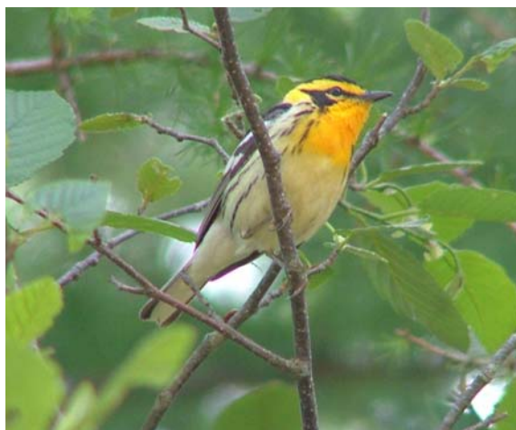
Blackburnian Warbler

any "expert" team could ever cover. So, while you should follow the atlas methods closely and be as accurate as you can, don't let yourself be frozen by the fear that the number of robins in your square might be off by a bit, or that a junco at one of your point counts might have really been a Wilson's Warbler. The atlas project is designed in such a way that such inevitable boo-boos won't wreck the overall results, and your participation is what gives the atlas such terrific coverage.