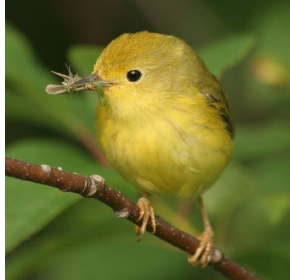
Yellow Warbler

record “00” in the 1 st visit column until a visit when breeding evidence is detected.