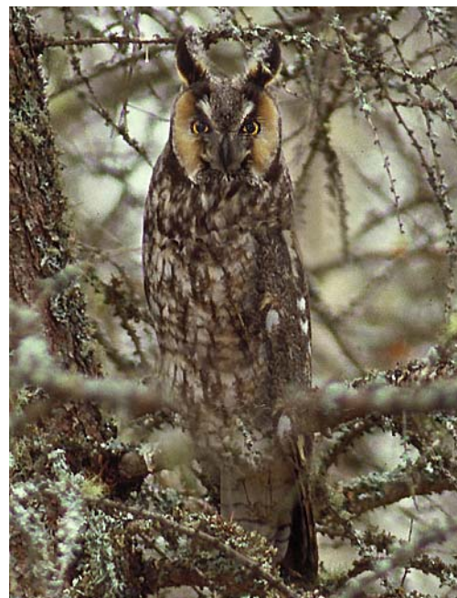
Long-eared owl

not build their own nest. Egg-laying begins in early April in old nests of crows or hawks. Crows usually nest near the edge of woodlands, next to clearings, and also along treed fencerows or small wooded areas around open fields. A good idea is to make a note of old crow nest locations so they can be later checked if Long-eared Owls are detected nearby. Viewed from the ground with binoculars, a pair of ear-tufts can often be seen above a nest occupied by Long-eared Owls. Look too for feather fluff on nearby branches, lost from adults flying to and from the nest. The young leave the nest in late May. After fledging, the young sometimes will be spotted until they learn how to take advantage of dense cover. If the adults become alarmed at a nest, they often fake injury, giving a long series of squeals, barks, moans, etc., and sometimes will flop around on the ground as if mortally wounded.