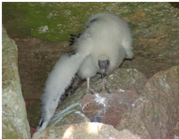
Turkey Vulture chick

With the second year of data collection complete, it's time to take a first look at our early results. Keep in mind that these results are quite preliminary-- there is still a lot of 2007 data to be entered and of course, three more years of data to be collected. As of today, 698 participants are registered for the Atlas—that's almost 200 more participants than were registered at this same time last year. As I am writing this, data have already been entered for 1,212 squares (that's double the number of squares that were visited last year), 215 species have been recorded and a whopping 2,848 point counts are complete. In addition, a lot of "new" species, not previously recorded during the first Maritimes Atlas, have been added to the Atlas list, including: Yellow-throated Vireo (found in all three Maritimes provinces), Yellow-headed Blackbird and a lone Le Conte's sparrow that spent his summer singing near Sussex, NB.