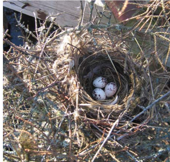
Eastern Kingbird nest

height varies from 1 to 20 m, but usually it's low.