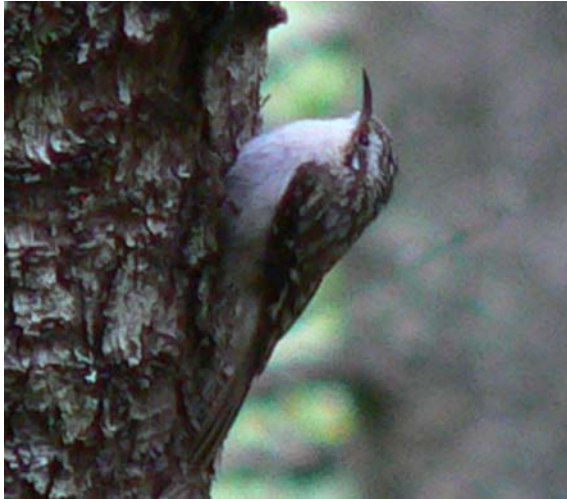
Brown Creeper

returned to check out the “new woodpecker”.