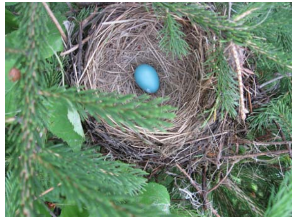
American Robin nest

One of the easiest nests to identify is a Ruby-throated Hummingbird nest. The nest's relatively small size distinguishes it from other species. The inside diameter of a hummingbird nest is approximately 3 cm with a height of 4 cm (a typical Yellow or Chestnut-sided warbler nest is double that size). The nest is a neat cup built with small plant down (like thistle or dandelion), decorated with bits of lichen and held together with spider webs. Nests are usually built in the fork of a branch or on a downward sloping twig. Nest height ranges from 1.5 to 15 m above ground or over water.