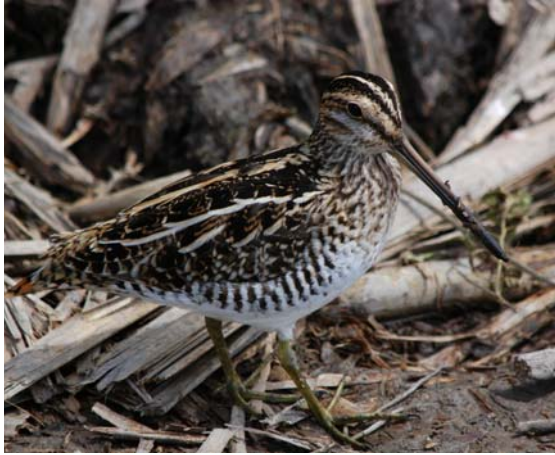
Wilson's Snipe

Great Horned Owl and later heard young begging in the nest (NY). She also found singing American Woodcock (T) and Wilson's Snipe (S) in the process. When she played her Boreal Owl call, coyotes answered nearby. That was thrilling.