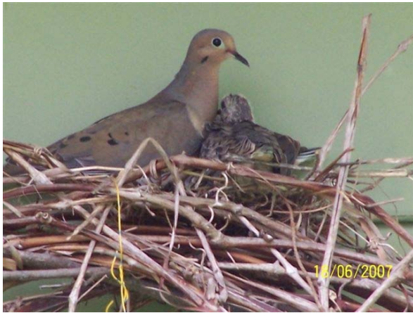
Mourning Dove nest

The Mourning Dove's nest is a platform of loose sticks and twigs, sometimes lined with finer twigs. Their nests are so loosely constructed that you can occasionally see right through the bottom of the nest. Mourning Doves can raise three or more broods in a single year. The best time to look for Mourning Dove nests is after the breeding season because, when disturbed, this species has a tendency to abandon the nest, even if it contains eggs or nestlings. Nests are usually found 5 to 25 feet from the ground, in a tree or in shrub.