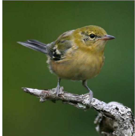
Bay-breasted Warbler

confirm breeding, but also measure abundance.