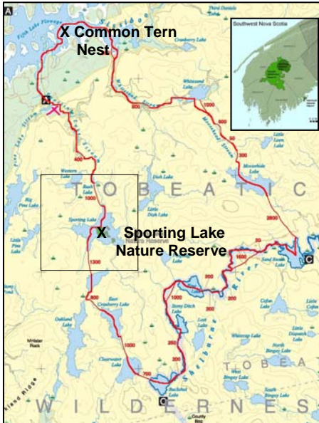
The Tobeatic Wilderness Area with our canoe route in red and the Sporting Lake square marked. Map in upper right corner shows wilderness area's location in southwest NS.

many of them fledglings, including Yellow-rumped, Blackburnian, Parula and Palm Warblers, plus a male Bay-breasted Warbler carrying a big green caterpillar in his bill. The islands were also the only place where we encountered Black-throated Green Warbler in the square, a strangely uncommon bird in the area. All of this transpired around noon hour: a time of day not usually associated with high bird activity. It just goes to show that magic can happen at anytime.