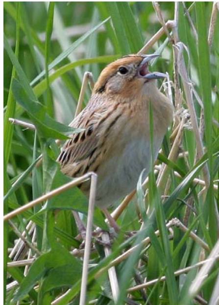
Sussex's LeConte's Sparrow

The Red-bellied Woodpecker was not recorded during the first Atlas. Since then, this species has become more prevalent on Christmas Bird Counts and nesting was confirmed in the Halifax-Dartmouth area in 2008. Red-bellied Woodpecker has also been recorded in the Annapolis Valley and Kent Regions.