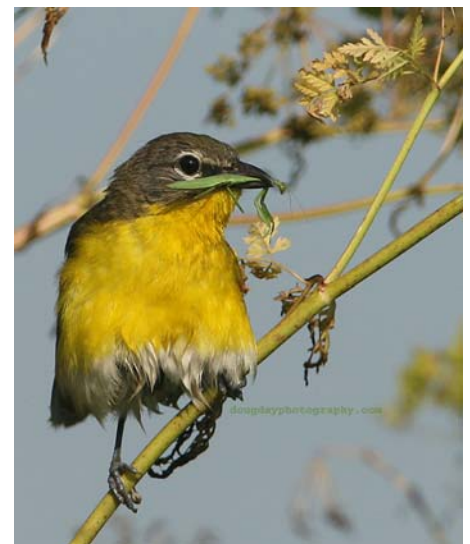
Yellow-breasted Chat, by Doug Day

Although few people would call me a rarity chaser (in fact fellow birders often chastise me for not chasing rarities enough), I did want to share some significant “rare” bird sightings that atlasers have submitted to the Atlas. Listed below are species which were not considered breeders during the first Atlas but for which there has been some breeding evidence recorded during this second effort. These examples may represent distributional changes, range expansions or breeding anomalies. Whatever the reason for their appearance, detecting any one of these rare birds is enough to make any atlasser’s day.