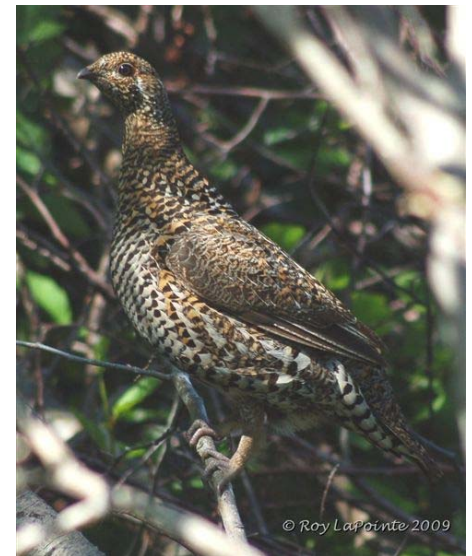
The no longer elusive Spruce Grouse

My goal for this season was to do at least 250 point counts and accumulate 225 hours of atlassing. I had 8 trips of 2 to 5 days planned primarily for point counts in June and another 6 trips of up to 5 days planned for BE atlassing in July. I expected to travel around 6,000 km with at least 4 trips to include travel by kayak or canoe.