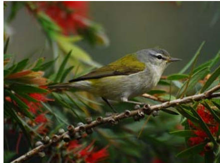
Tennessee Warbler

NL, where boreal forests dominate the landscape. NB has shown a significant decrease in Tennessee Warblers (-5.3% annually) on BBS routes from 1968-2007, though no declines have been detected in the other two Maritime provinces. A preliminary comparison of the first and second Maritimes Breeding Bird Atlas data shows a substantial decrease in the number of squares with Tennessee Warblers. Tennessees have only been detected in 428 squares in comparison with the 934 squares in which they were found during the first Atlas.