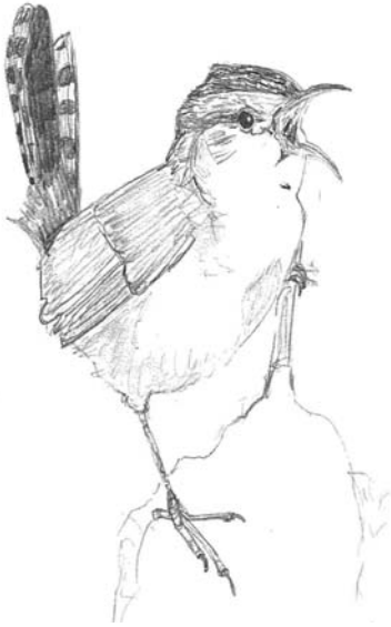
Marsh Wren