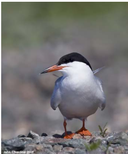
Is he the quintessential Common Tern?