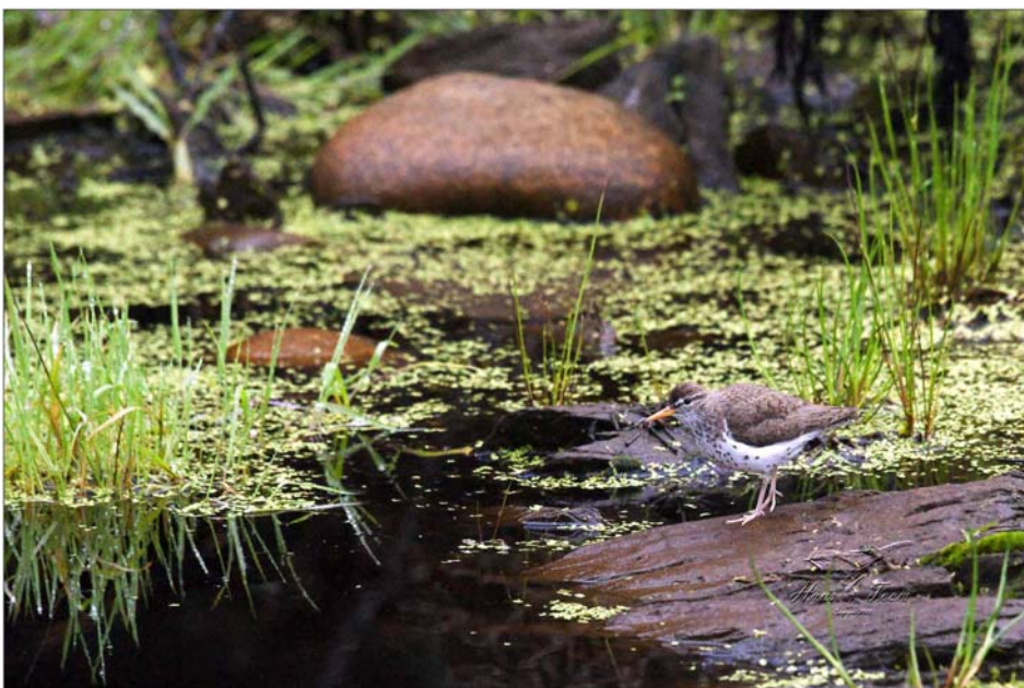
Spotted Sandpiper on Flat Island.

There were many amazing moments so it's hard to know where to begin. To start, I have never been anywhere where the Blackburnian Warblers were so plentiful. In June I was literally trying to "tune out" the Blackburnians so I could hear other species. This high density of Blackburnians is almost certainly explained by the habitat. On Sporting Lake there are three islands that make up a 25 hectare nature reserve. These islands harbour one of the few remaining stands of old-growth forest in NS. Here you can find huge hemlock, pine and spruce trees that have grown, relatively undisturbed, for hundreds of years. It was on these islands that Kyle Wellband and I encountered, Pine Grosbeak during our second visit to the square in early July. We had pulled up to the islands to have lunch and explore the island. Shortly thereafter, we heard a bird singing that sounded familiar but wasn't anything we had encountered in recent weeks. As I looked through my binoculars at the rosy-red singer I vaguely remember hollering, "Omigod, I think it's a Pine Grosbeak". A few minutes later Kyle spoke up, "ah...I've got a fledged young grosbeak here". With a bit of pishing we had the entire grosbeak family flitting above us, and they weren't the only ones that came in to check out the commotion. Soon the canopy was "hopping" with warblers,