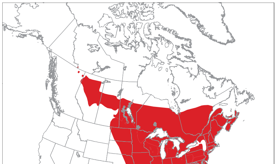
Figure 2. Canada Warbler range./Figure 2. Aire de répartition de la Paruline du Canada.

In eastern North America, the draining of swamp forests for agriculture, commercial, and residential development has resulted in extensive habitat loss, while in western Canada, boreal mixed-wood